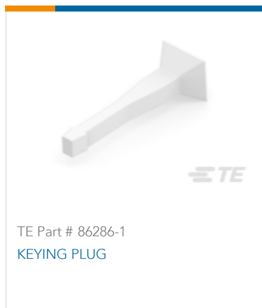
TE Part # 86286-1 KEYING PLUG