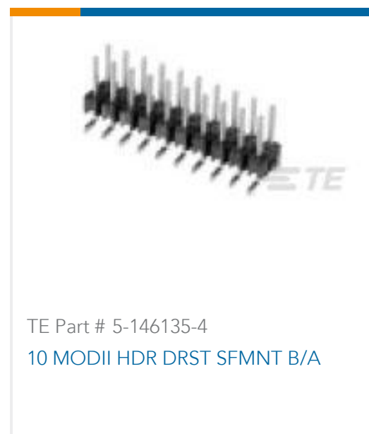
TE Part # 5-146135-4 10 MODII HDR DRST SFMNT B/A