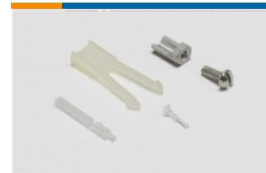
PCB Connector Keying(4)