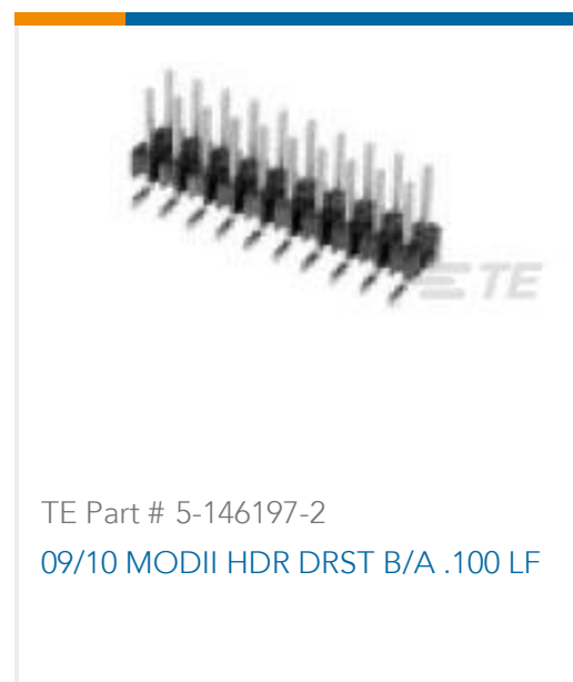
TE Part # 5-146197-2 09/10 MODII HDR DRST B/A .100 LF