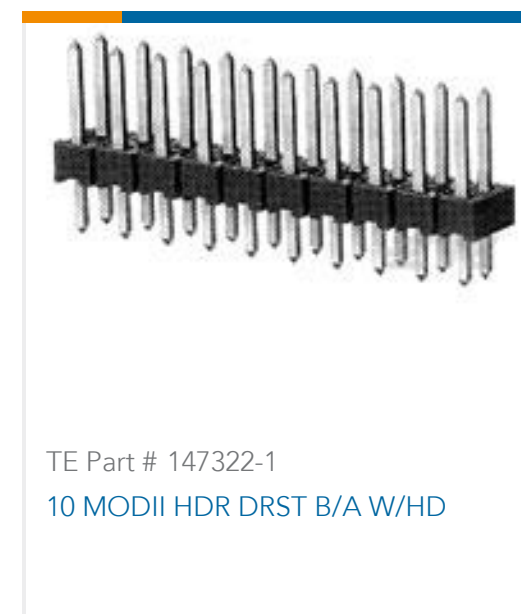
TE Part # 147322-1 10 MODII HDR DRST B/A W/HD