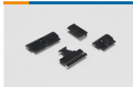
PCB Connector Covers(4)