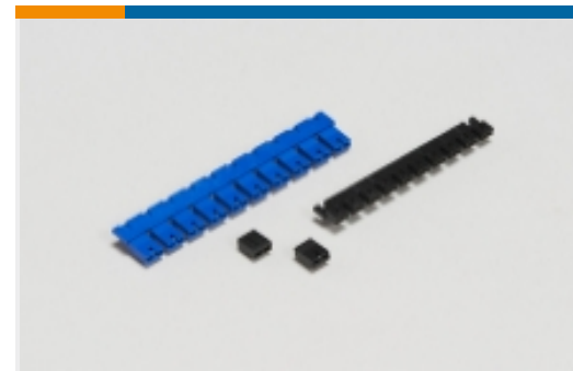
Board-to-Board Jumpers &amp; Shunts(5)